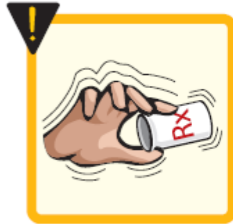
Potential for addiction